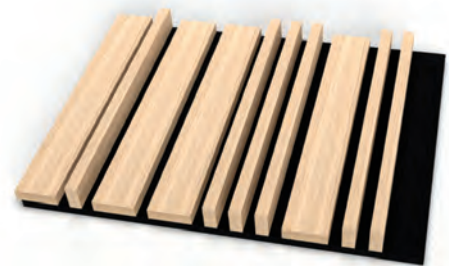
LINEA Mixed Grille